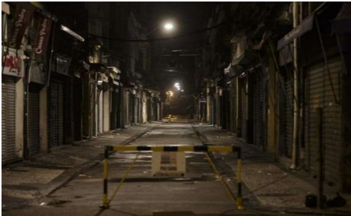
FIGURE 3: Central areas that are abandoned in Rio de Janeiro.