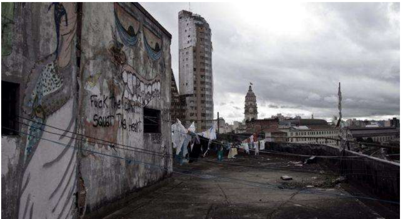
FIGURE 1: Downtown São Paulo with buildings abandoned and graffitied by the population.

SOURCE: Maycon Amoroso / BBC Brazil. MORI, 2018, online report.